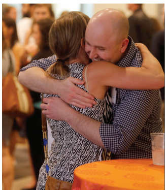
Friends reconnected at the 2017 BRET Reunion

I felt the need to reminisce in the Tyska microscope room, an area where I spent so many hours as a graduate student performing cell imaging assays on the TIRF scope. Spending time catching up with the lab was a perfect way to wrap up the reunion events. And, with the reunion planned for Thursday and Friday only, we were left with a whole weekend to enjoy and explore Nashville. I’m hoping for another BRET reunion in 5 years!